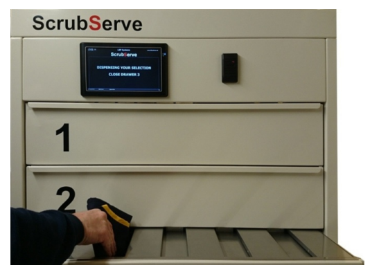
When a drawer is unlocked the staff member is only able to access one compartment from the 11 available. E.g. compartment 4 as shown above

For more information please contact us at info@scrubserve.com