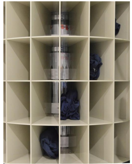
View of Storage Compartments